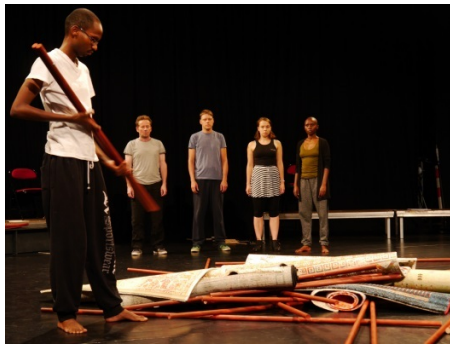
Ishyo Arts Centre (Rwanda) & HELIOS Theater (Germany): "Our House"