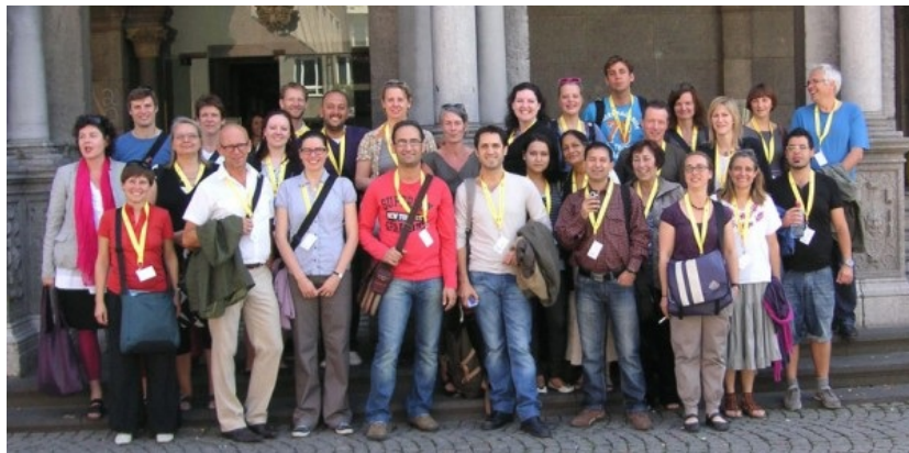
Director Seminar 2011