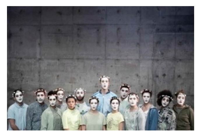
Unga Klara, "X".