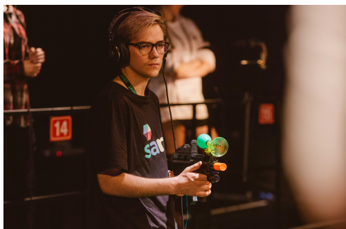
Photo from "Evros Walk Water", Rimini Protokoll