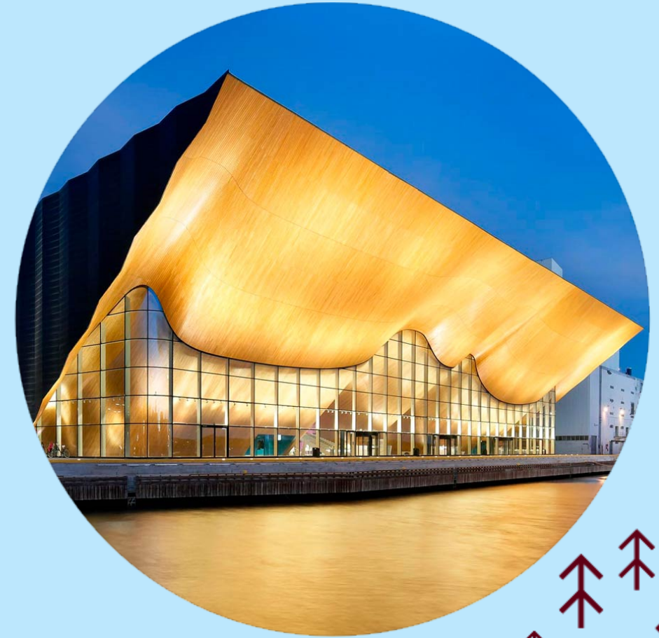
Photo: Kilden theatre and concert hall

The Nordic Venue program was located at a venue called Teateret. The Nordic Venue program was created in collaboration with the Nordic-Baltic Assitej Network and featured one production from each of the countries plus Sápmi and Greenland, ten productions in total, and professional events. The Nordic Venue was also the base for the Youth Delegate Program. Link to Teateret: www.teateret.no