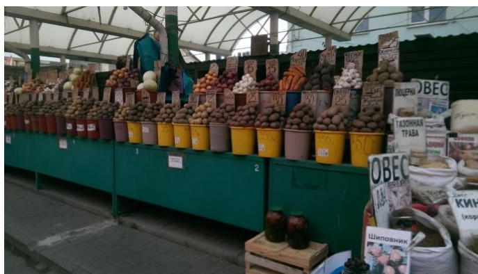
A stall with a huge variety of potatoes!

I was interested to note Russian people appear fit and eat well, - maybe because they can't afford ready-made take-away food. I saw little or no obesity. Their diet is simple, and I doubt there are many breakfast guests in the UK who munch on great swathes of green herbs – dill and coriander, alongside their Weetabix!