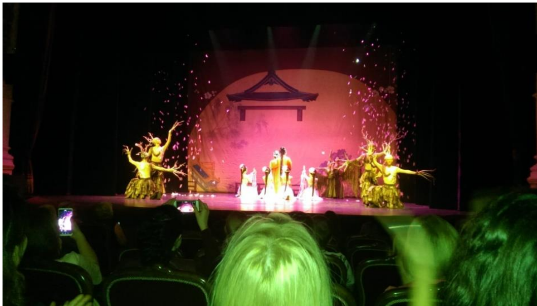
Wonderful Peking Opera from Zhejiang, China!

The Russian people truly like and invest in their young and I was interested to see so many young children with their families in the theatre, all well-dressed and polite, or in the company of their Babushkas. It seems you don't mess with your Granny! These formidable ladies have